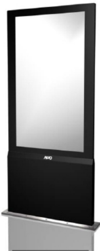
With simple stand