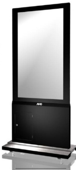
With full size stand